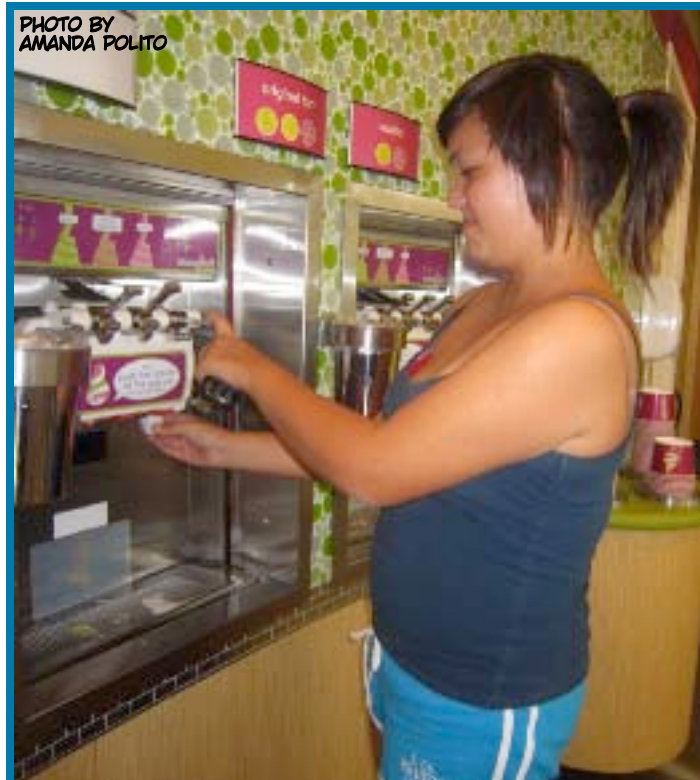
Students pour in the yogurt during Xtreme's fundraiser at Menchie's on Sept. 12.